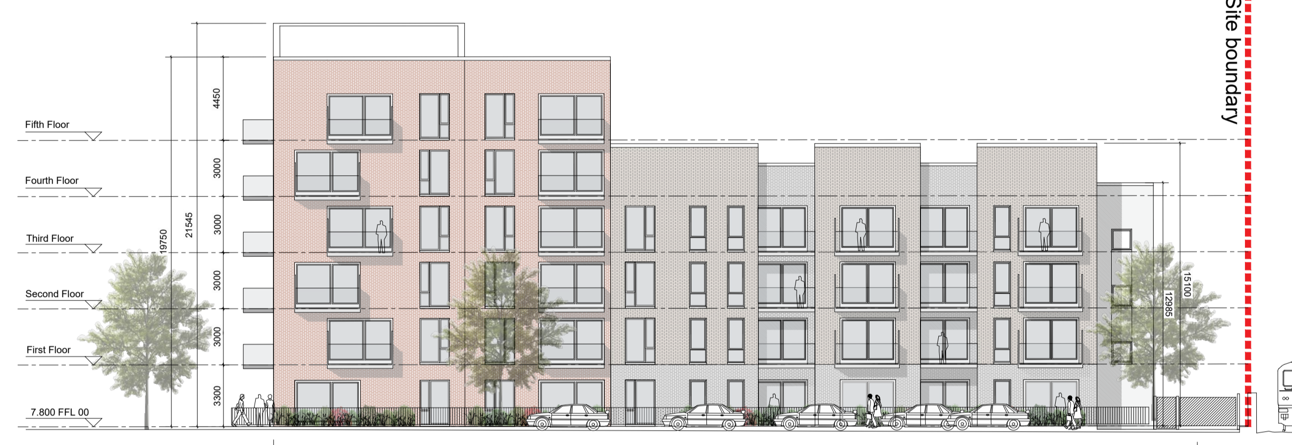
BLOCK 11 - SOUTH ELEVATION TO STATION STREET