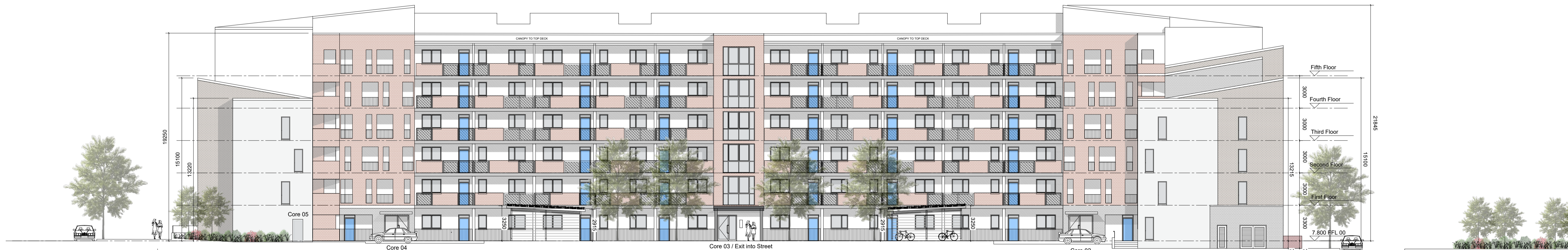
BLOCK 11 - EAST ELEVATION TO RAILWAY