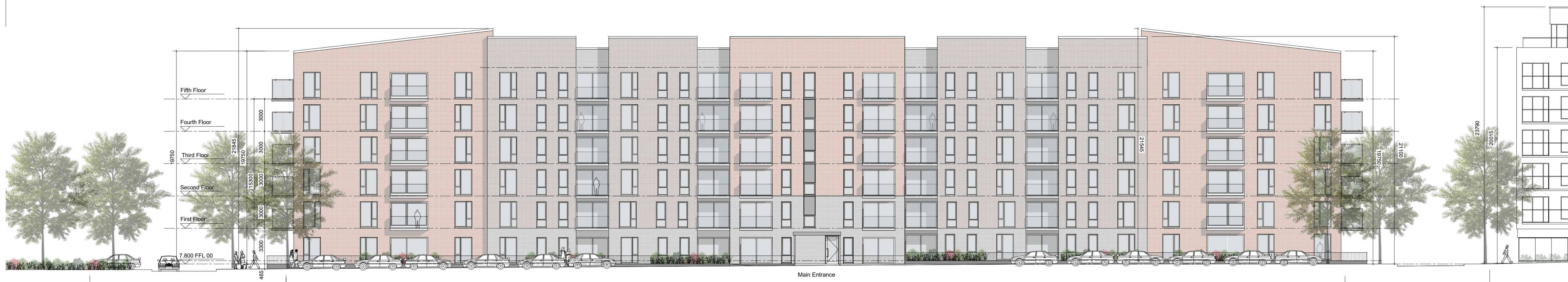
RAILWAY PARK RAILWAY LANE NORTH BLOCK 11 RAILWAY LANE SOUTH BLOCK 28 BLOCK 11 - WEST ELEVATION TO STATION STREET